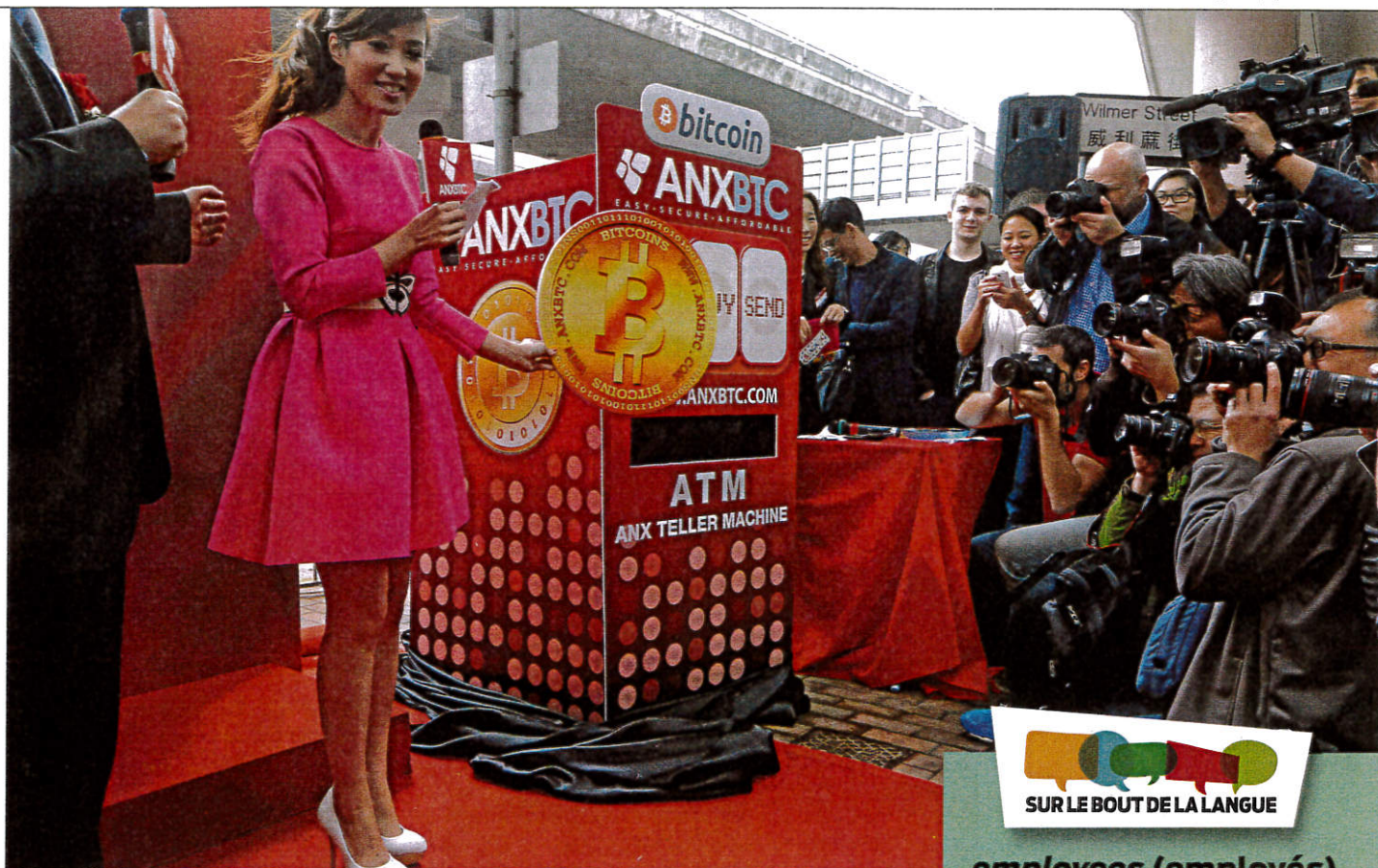
Opening ceremony of a bitcoin retail shop in Hong Kong.

CEO of Token, an identity-ring maker in New York. "But we're technologists, and technology provides freedom" from centralized government systems.